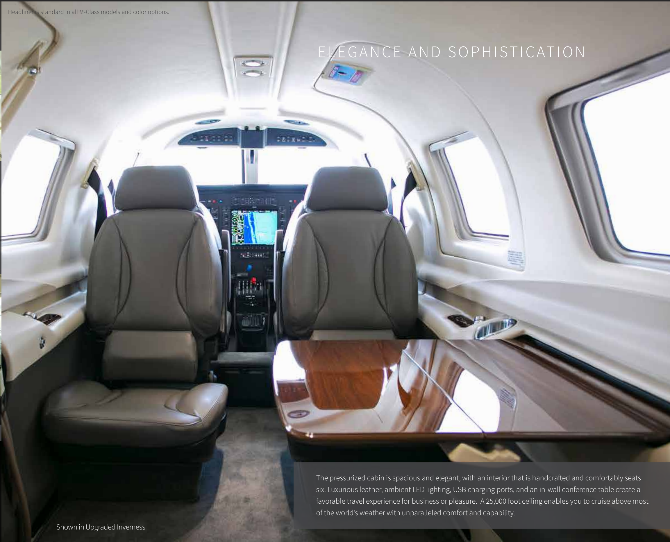
Shown in Upgraded Inverness

The pressurized cabin is spacious and elegant, with an interior that is handcrafted and comfortably seats six. Luxurious leather, ambient LED lighting, USB charging ports, and an in-wall conference table create a favorable travel experience for business or pleasure. A 25,000 foot ceiling enables you to cruise above most of the world's weather with unparalleled comfort and capability.